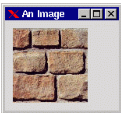
Figure 8.7: Canvas Image Object

The canvas image object displays images and moves them around in a simple way. The currently supported image formats are bitmap and gif.