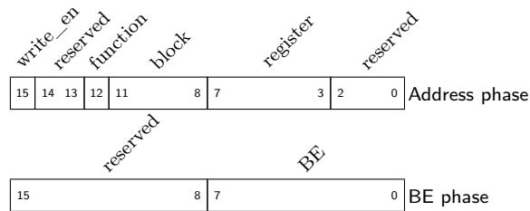
Figure 1: Address and BE phases for register access