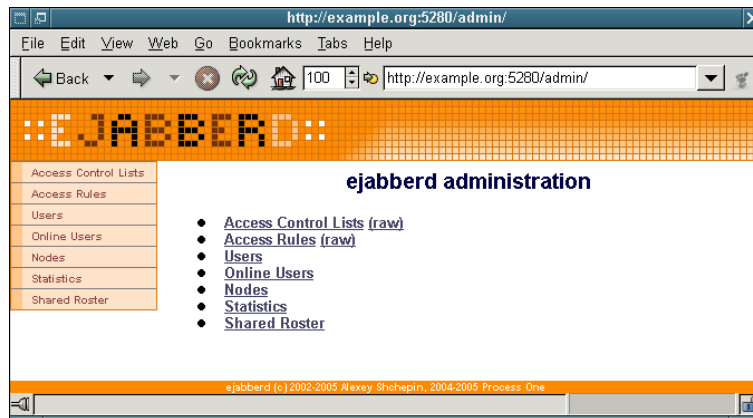
Figure 1: Top page from the web interface