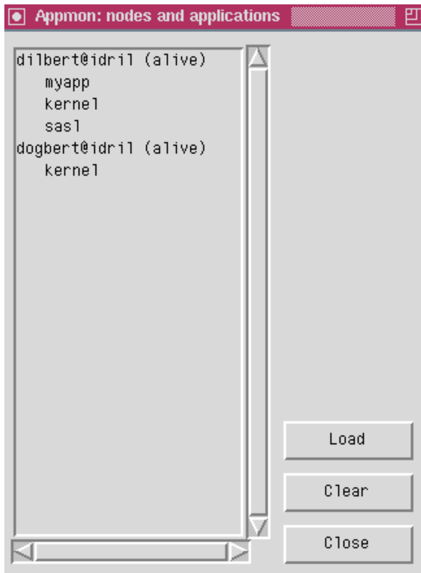
Figure 1.3: The Listbox Window.