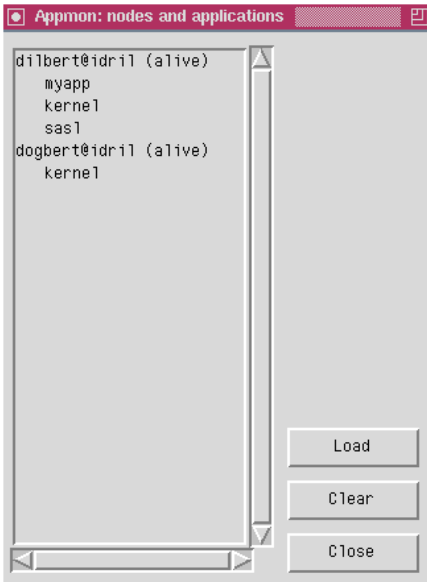
Figure 1.3: The Listbox Window.